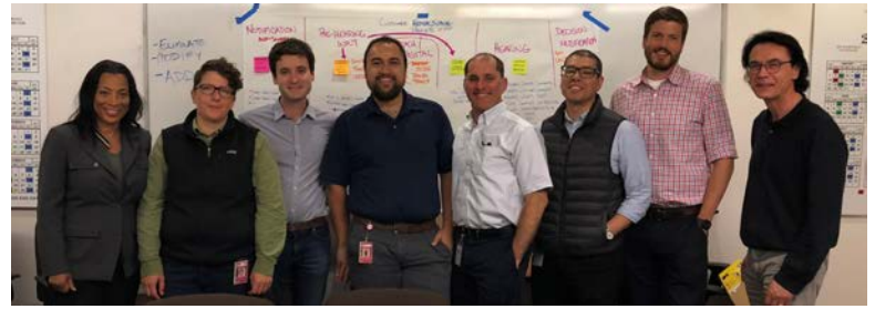
Members of the SFMTA Communications & Marketing, Sustainable Streets, and Transit divisions convened to address issues with the public outreach process for small- to medium-sized projects.

The SFMTA notifies the public about proposed street and traffic modifications by posting notices in San Francisco neighborhoods and holding public hearings on proposed changes. Members of the public report that notification can be inadequate and that SFMTA can appear to make decisions regardless of the public input received. Occasionally, public hearings can be unexpectedly contentious and delay project execution.