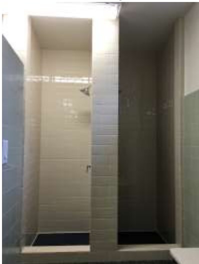
FS 20 Complete