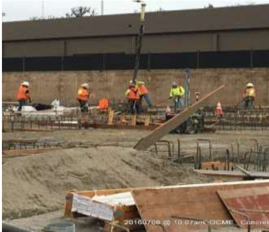
Placement of concrete at great beam