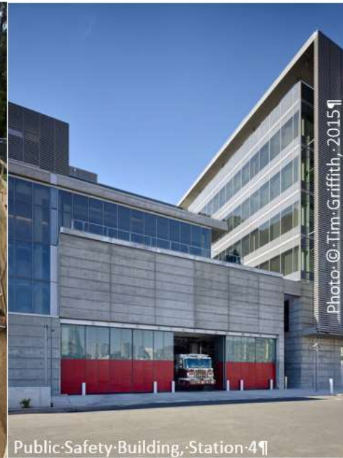
Public Safety Building, Station 4