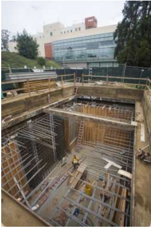
Laguna Honda Hospital cistern