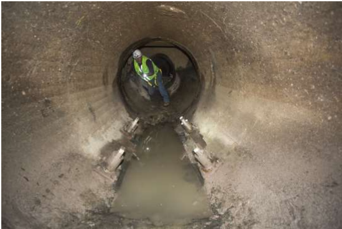
Pumping Station 1 Tunnel – anchors for HDPE pipe resilient inserts