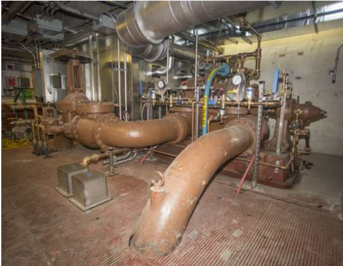
Pumping Station 1 – new pump engine enclosure and ducts