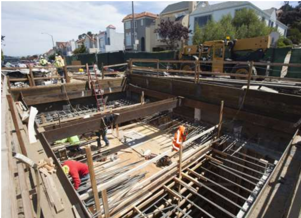
17 th Avenue & Pacheco Street cistern, June 2016