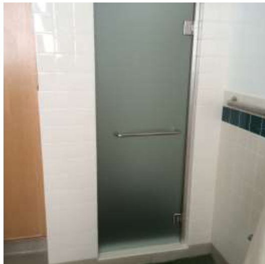
FS 34 Complete