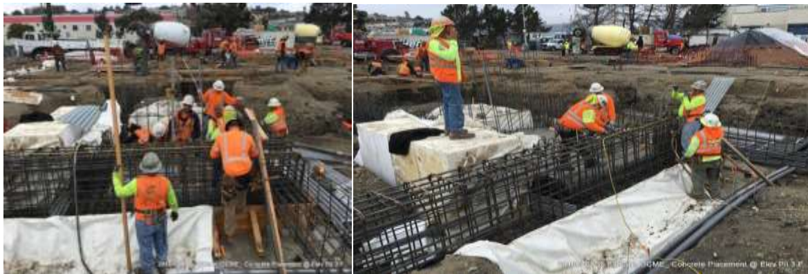
Service Elevator pit concrete slab