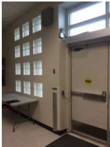
Bayview station: new door actuator and signage at entrances