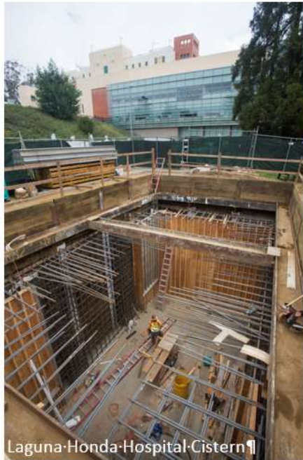
Laguna Honda Hospital Cistern

sfpublicworks.org facebook.com/sfpublicworks twitter.com/sfpublicworks