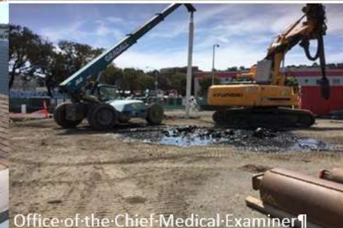
Office of the Chief Medical Examiner