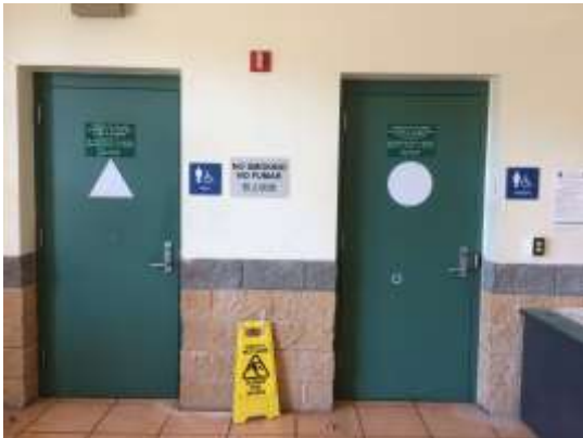
Mission station: new door and wall signage in ADA restrooms