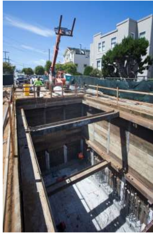
18th Avenue & Moraga Street cistern