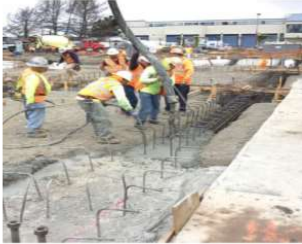
PC's & GB's concrete placement