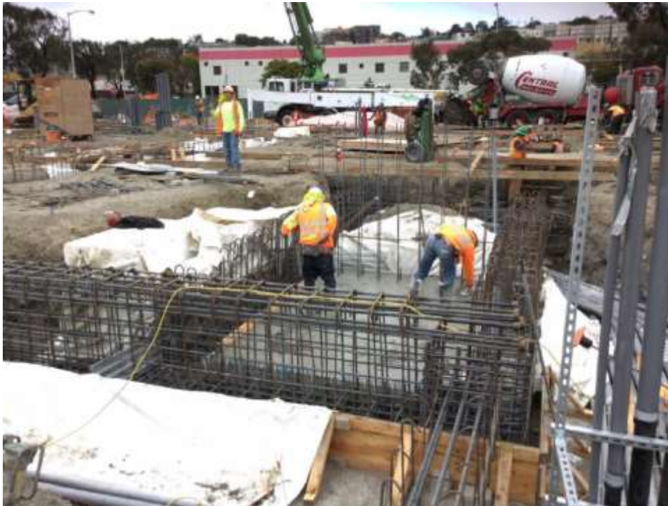
Placement of concrete slab at elevator pit