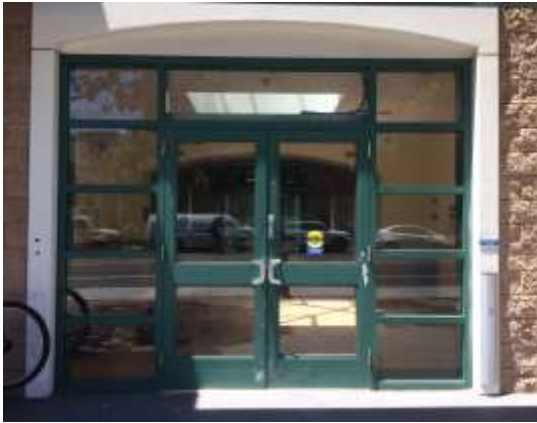
Mission station: new door actuator and signage at main entry