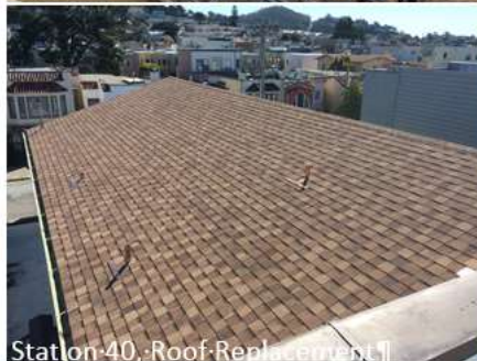
Station 40, Roof Replacement