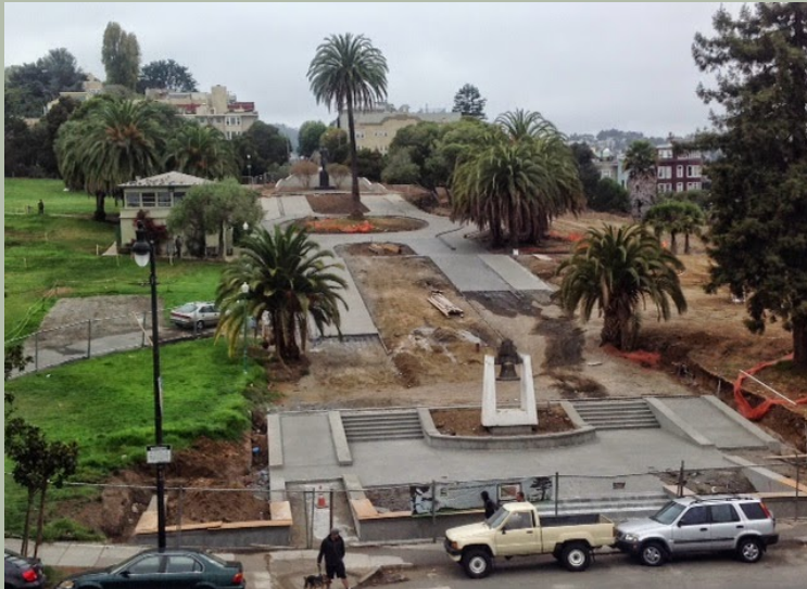
Mission Dolores Park

Mission Dolores Park in construction! Raymond Kimbell Playground in construction!