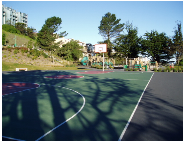
Walter Haas Playground