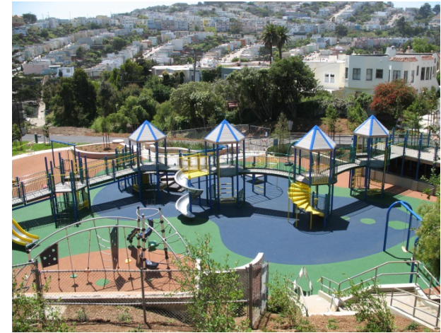
St. Mary's Playground