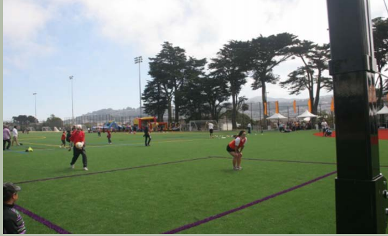
Football, volleyball, and soccer fields at Minnie and Lovie Ward Playfield Opening Day September 14, 2014