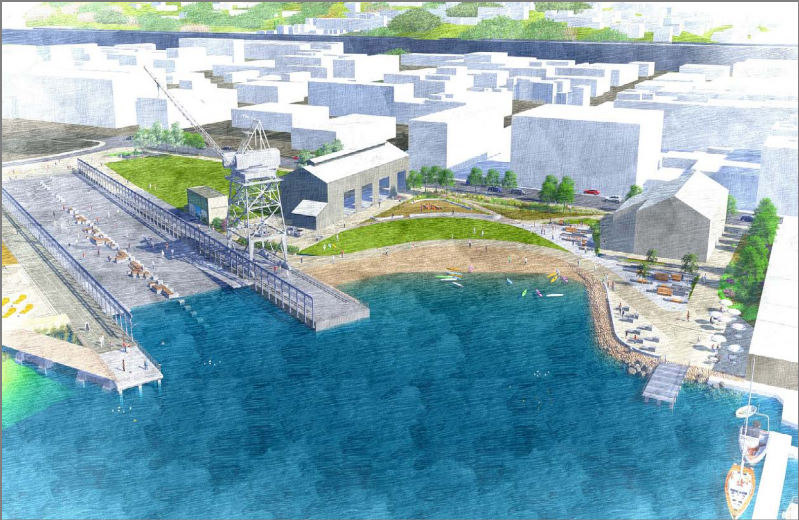
Site plan rendering of Crane Cove Park