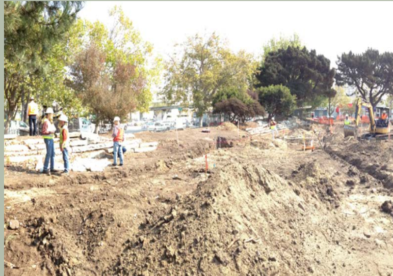
Raymond Kimbell Playground