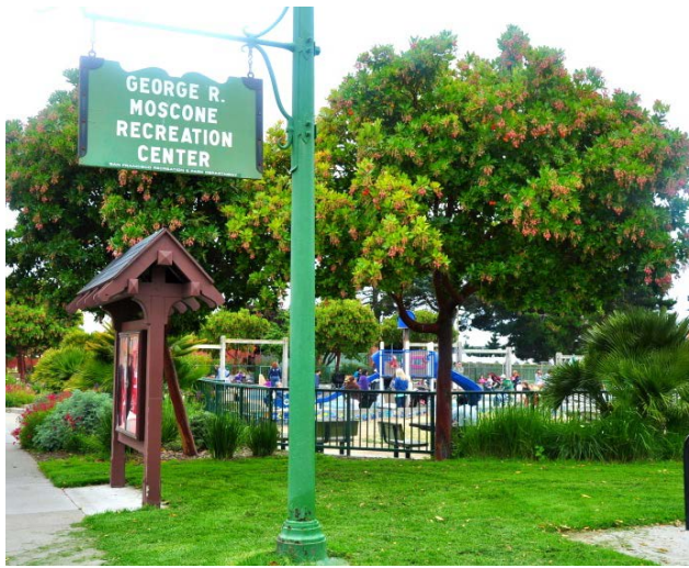
Moscone Recreation Center