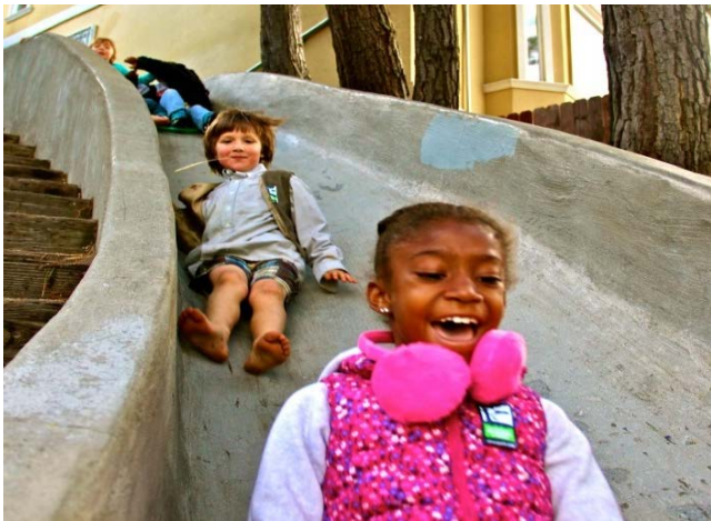
Crocker Amazon Playground