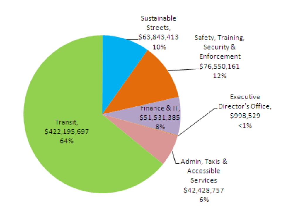
EXHIBIT 1 San Francisco Municipal Transportation Agency Operating Budget for Fiscal Year 2010-11 Excluding Agency-wide Expenses