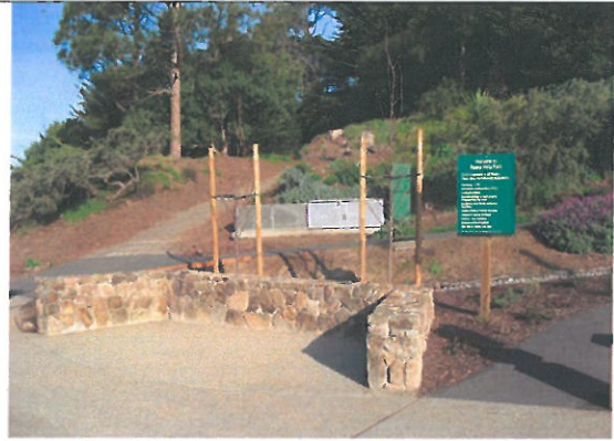
Buena Vista Landscape Improvement reopened to the Public in January 23, 2010.