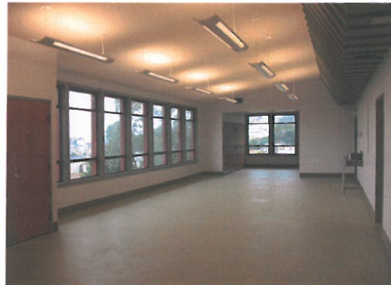
Sunnyside Clubhouse reopened to the Public in November 7, 2009.