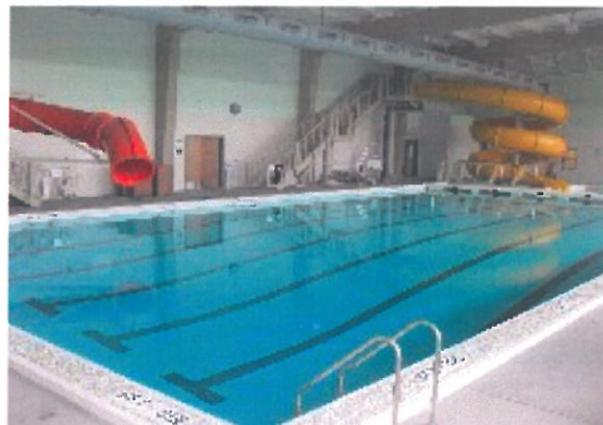
Hamilton Recreation Center, Playground, & Swimming Pool reopened to the Public in March 6, 2010.