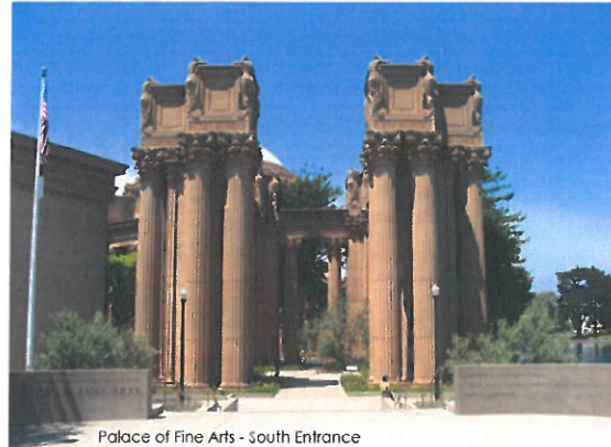
Palace of Fine Arts Restoration reopened to the Public in January 14, 2011.