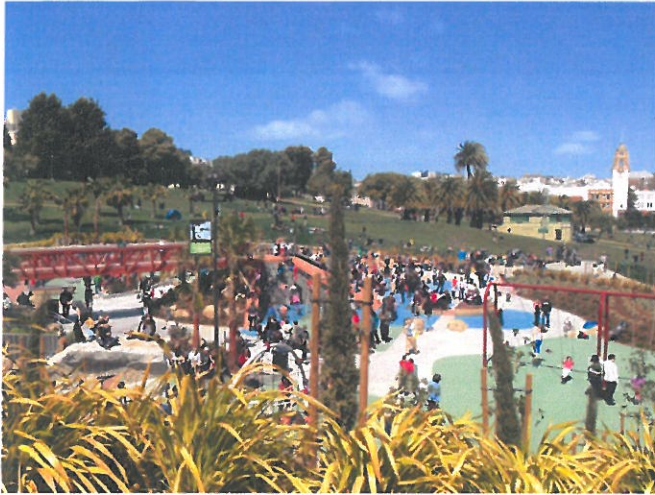
Mission Dolores Playground