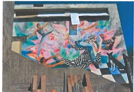
Harvey Milk Recreational Art Center Opened to the Public in June 27, 2009