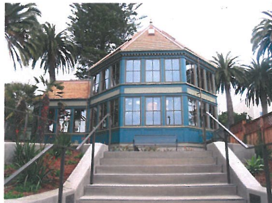
Sunnyside Conservatory Restoration reopened to the Public in December 5, 2009 and received a 2010 APWA Project of the Year Award for