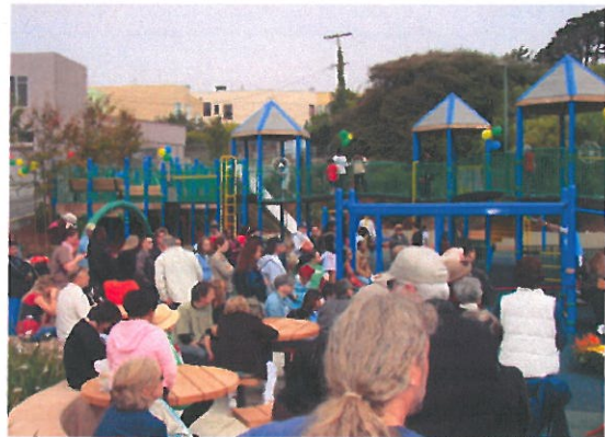
St. Mary's Playground reopened to the Public in July 25, 2009