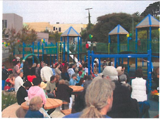
St. Mary's Playground reopened to the Public in July 25, 2009