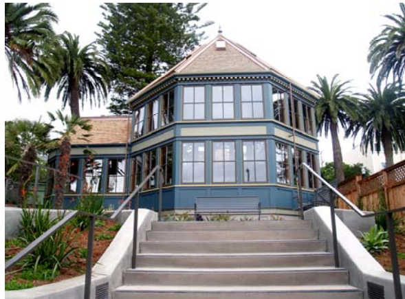
Sunnyside Conservatory Restoration reopened to the Public in December 5, 2009 and received a 2010 Award from the APWA for Historical Restoration Excellence.