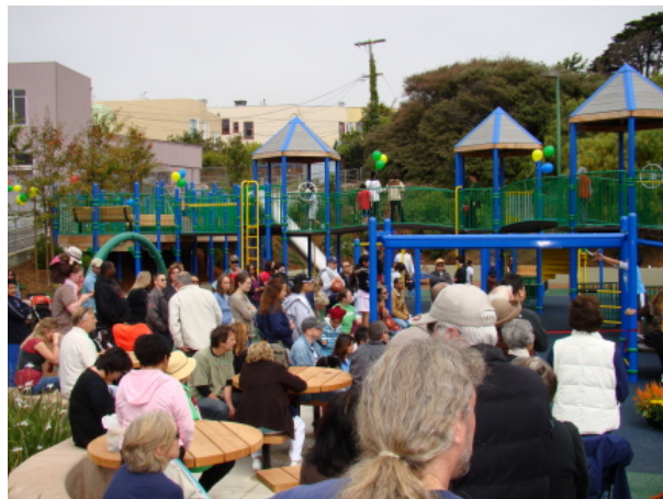
St. Mary's Playground reopened to the Public in July 25, 2009