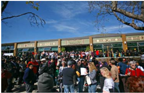
Hamilton Recreation Center