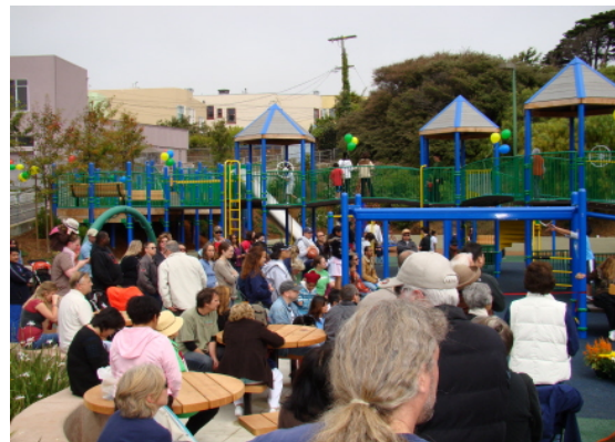
St. Mary's Playground reopened to the Public in July 25, 2009