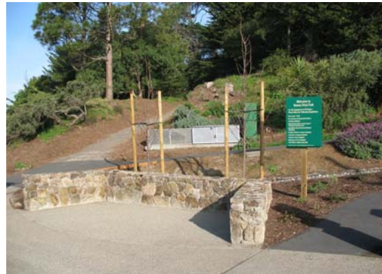
Buena Vista Landscape Improvement reopened to the Public in January 23, 2010.