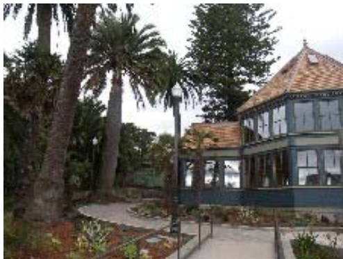
Sunnyside Conservatory Restoration