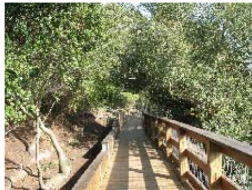
Buena Vista Landscape Improvement