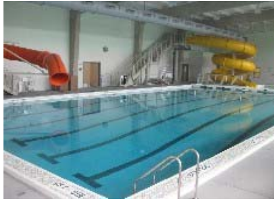
Hamilton Recreation Center, Playground, & Swimming Pool reopened to the Public in March 6, 2010.