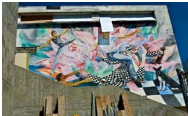
Harvey Milk Recreational Art Center Opened to the Public in June 27, 2009