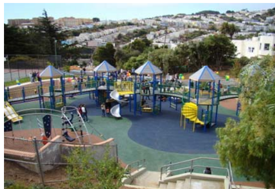
St. Mary's Playground