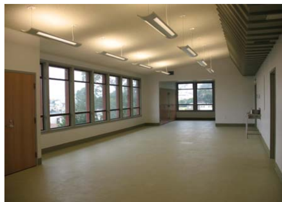
Sunnyside Clubhouse reopened to the Public in November 7, 2009.